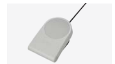
Foot Switch FS-24*