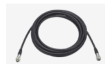
Extension Cable CCMC-EA05: 16.4 ft (5m)