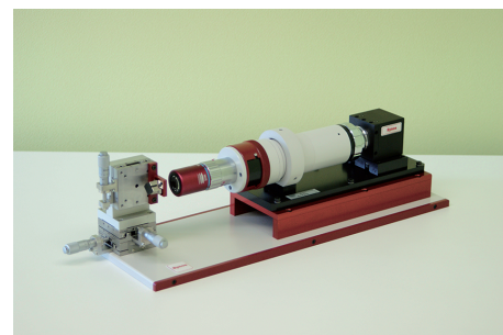
Photo:M-Scope type L, including optional InGaAs high sensitivity NIR detector ISA041, objective lens, optics bench for fiber measurement

☞ About measurement view and pixel resolution, please refer to P31 (objective lens).